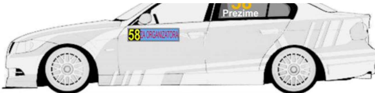
Zadnjim levim i desnim bočnim staklima, broj je visine 20cm sa debljinom linije od 2.5cm, font je Arial BOLD

Boja ovih brojeva je floroscentno narandžasta i to PMS 804