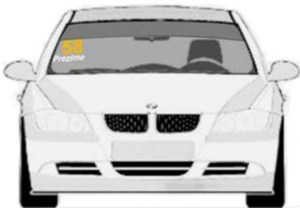
Prednjem vetrobranskom staklu. broj je visine 14cm sa debljinom linije od 2cm, font je Arial BOLD