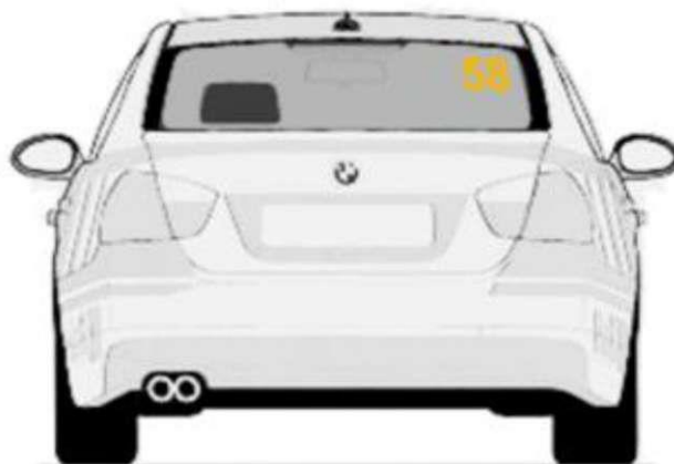
Zadnjem vetrobranskom staklu. broj je visine 14cm sa debljinom linije od 2cm, font je Arial BOLD